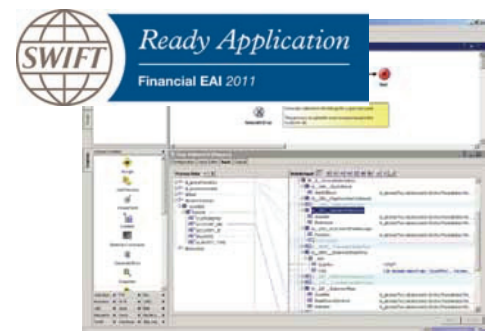
TIBCO's solution provides an intuitive graphical user interface for formatting, parsing, validating, mapping and transformation of SWIFTNet messages.

TIBCO provides a comprehensive integration platform that helps companies automate the processing of complex SWIFTNet FIN, InterAct and FileAct messages, thereby bridging the gap between internal systems and SWIFTNet infrastructure. TIBCO's SWIFT certified integration platform, TIBCO BusinessWorks™, provides a graphical user interface (GUI) for creating and defining integration scenarios (connectivity, validation, mapping and transformation), an engine that automates routine sequences of tasks in real time, and a web-based interface for monitoring applications and activities. TIBCO BusinessWorks™ in combination with TIBCO® Adapter for SWIFT software provides connectivity to SWIFT Alliance Access (SAA) and SWIFT Alliance Gateway (SAG) and enables the bi-directional routing of SWIFTNet-based messages to and from applications across the enterprise.